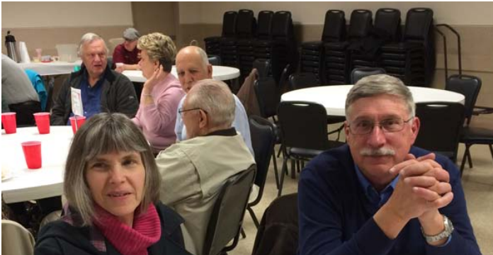
Family Night February 2015

STANDING COMMITTEES GET INVOLVED!! PARTICIPATE - IT'S EASY!