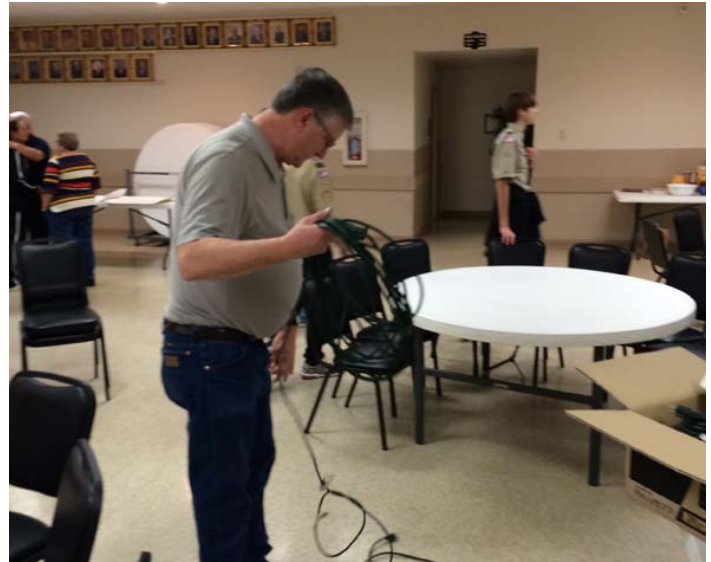
No Time to Panic