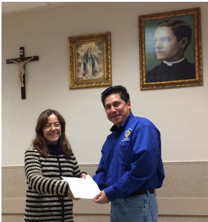
Presenting the check for $1000 during Family Night February 2015