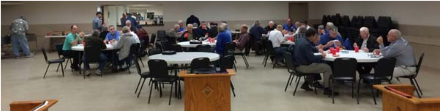
Business Meeting February 2015