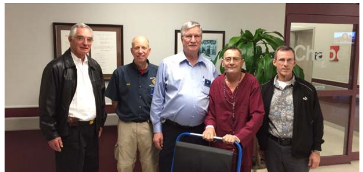
Brother Knights visiting with the Veterans

Serving Texas in Harris and Montgomery Counties