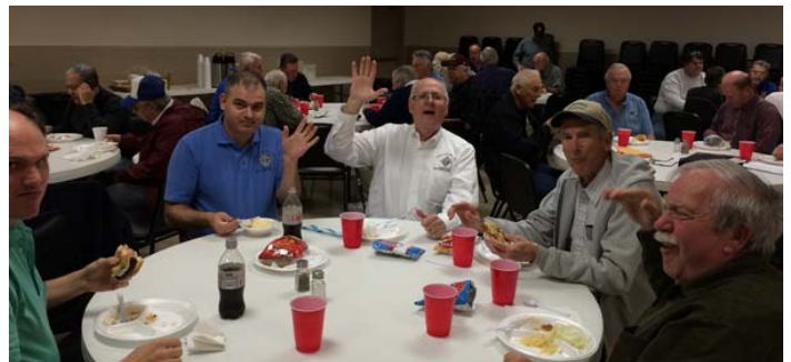
Business Meeting February 2015