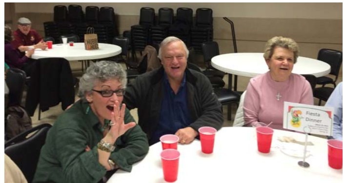
Family Night February 2015