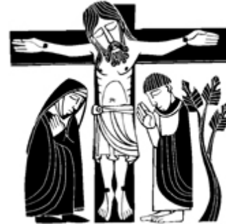
Becoming Companions at the Foot of the Cross