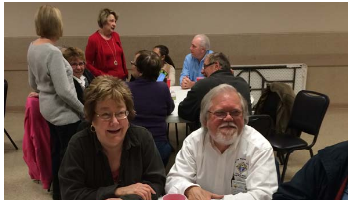
Family Night February 2015